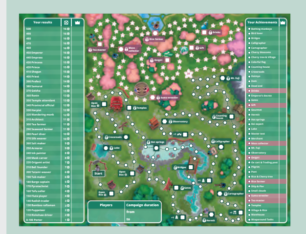
1 Campaign pad (20 sheets, printed on one side)