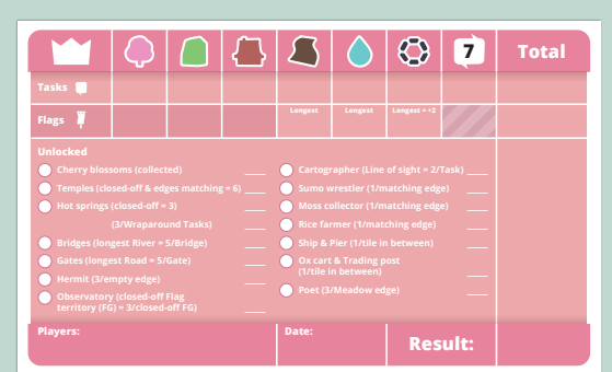
1 Score Pad (50 sheets, printed on both sides)