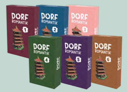
FAQ and examples of the unlocked components can be downloaded from: www.pegasus.de/en

47 Cards | 77 Tiles | 1 Board | 9 Wooden components