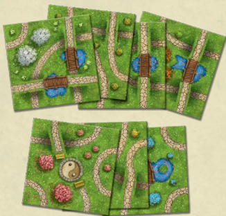
7 Garden tiles