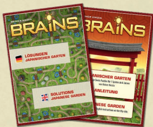
1 booklet with First Hints and Solutions