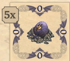
Dragon Egg (printed value of 0)