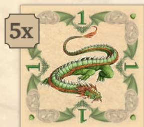
Emerald Dragon (printed value of 1)