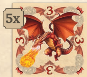
Ruby Dragon (printed value of 3)