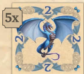
Sapphire Dragon (printed value of 2)