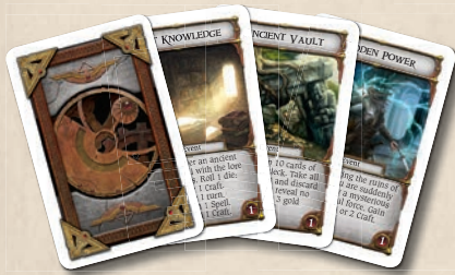
25 REMNANT CARDS