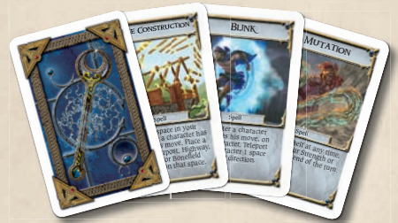
10 SPELL CARDS