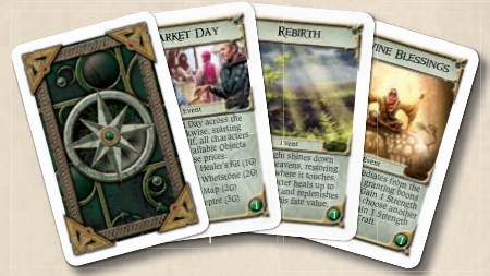
47 ADVENTURE CARDS