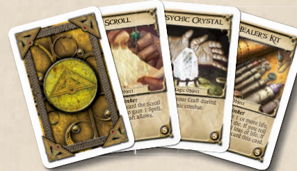
24 PURCHASE CARDS