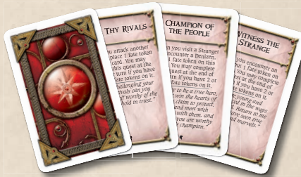
6 WARLOCK QUEST CARDS