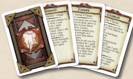
40 DENIZEN CARDS