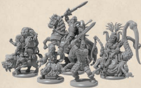
5 CHARACTER FIGURES (note that due to packaging/shipping the figures are placed underneath the box insert)