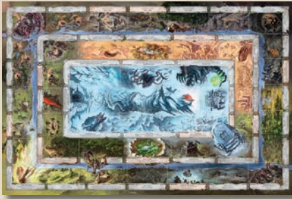
1 CATACLYSM BOARD