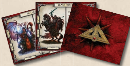
5 CHARACTER CARDS