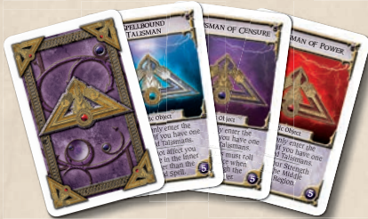
6 TALISMAN CARDS