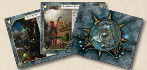
4 ALTERNATIVE ENDING CARDS