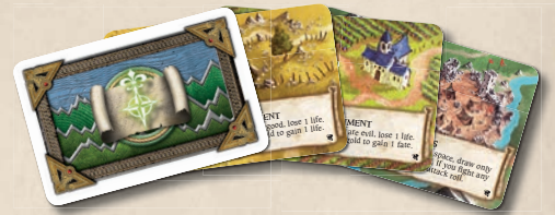
10 TERRAIN CARDS